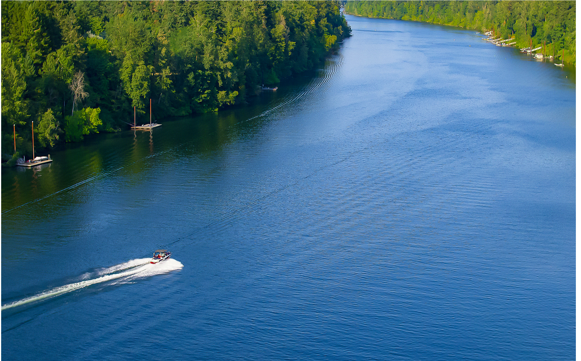
Willamette River waterfront w/private dock and boat slip